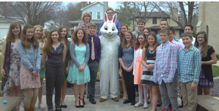
The Easter Bunny and his helpers just before the Easter Egg Hunt for our younger children.