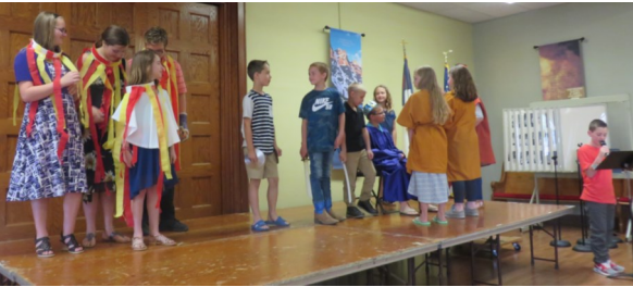
Everyone had a GREAT time celebrating the end of the school year at the Sunday School Talent Show! Congratulations to all of the performers on a job well done!